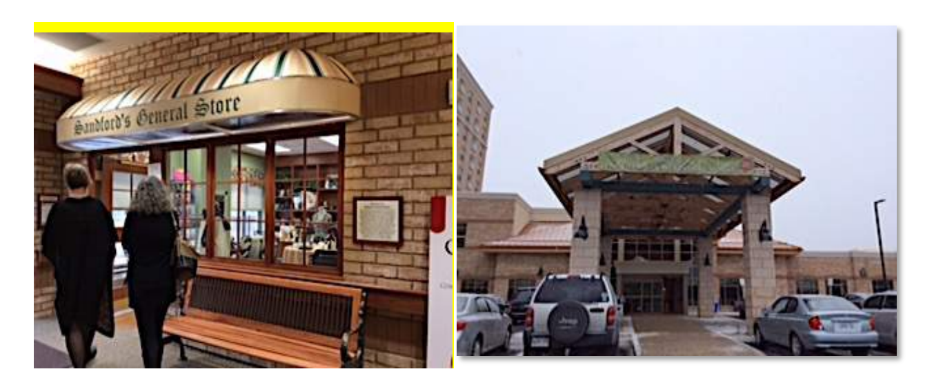
A Schlegel Village, Canada

Schlegel Villages offer residential living that combines quality long-term care with retirement villages across Ontario, Canada. They cite their defining features as: physical design, investment in people, integration with the larger community, and innovation. The design of the space creates a 'village' feel, with recognisable places such as Town Square and Main Street. The communities also provide a Town Hall, café and Community Centre. Integration with the larger surrounding communities is essential to the ethos of Schlegel Villages<sup>9</sup>.