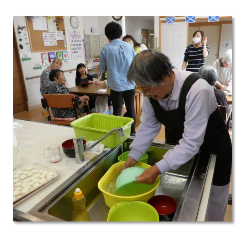
Japan group home

Japan, with over 5 million people living with dementia, has developed innovative accommodation models which enable people with dementia to live as active citizens and remain connected within their communities. Japan now has over 12,000 state-funded dementia group homes.